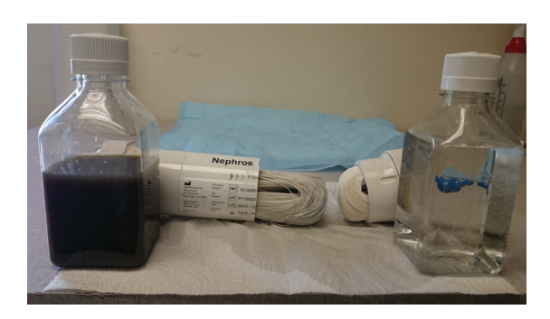
Typical removal results of a Nephros filter.