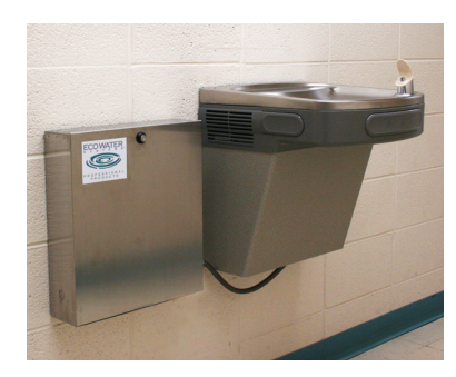
Drinking Water Fountain